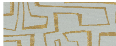
Golden Hour 1012233