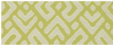
Key Lime 1012238