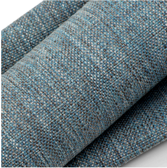
Repeats Not Shown to Scale.