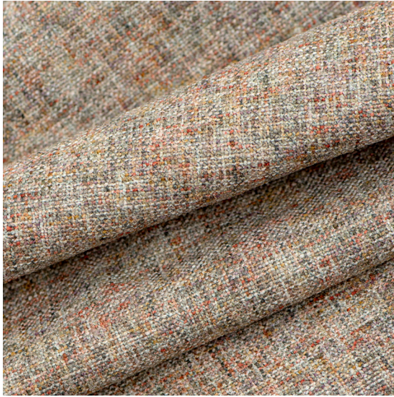
Repeats Not Shown to Scale.