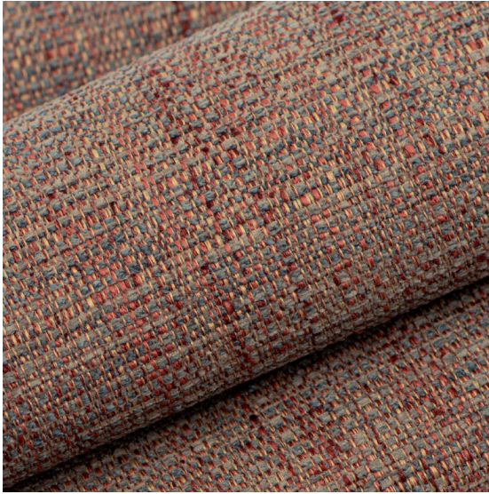
Repeats Not Shown to Scale.