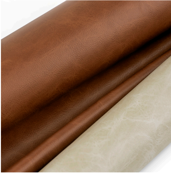
Repeats Not Shown to Scale.